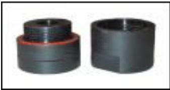
Figure 2. DS9107 iButton Capsule.

It is important to note that the data loggers are not recommended for any type of fluid immersion. If the application requires submersion in a liquid, then the device should first be placed in a waterproof container. An example of a suitable waterproof container is the DS9107 (iButton Capsule) ( Figure 2 ) that is certified to IP68. IP68 indicates an extended immersion under pressure. The DS9107's IP68 rating has been defined as 100ft (30.5m) equivalent pressure for 24 hours ( Table 1 ).