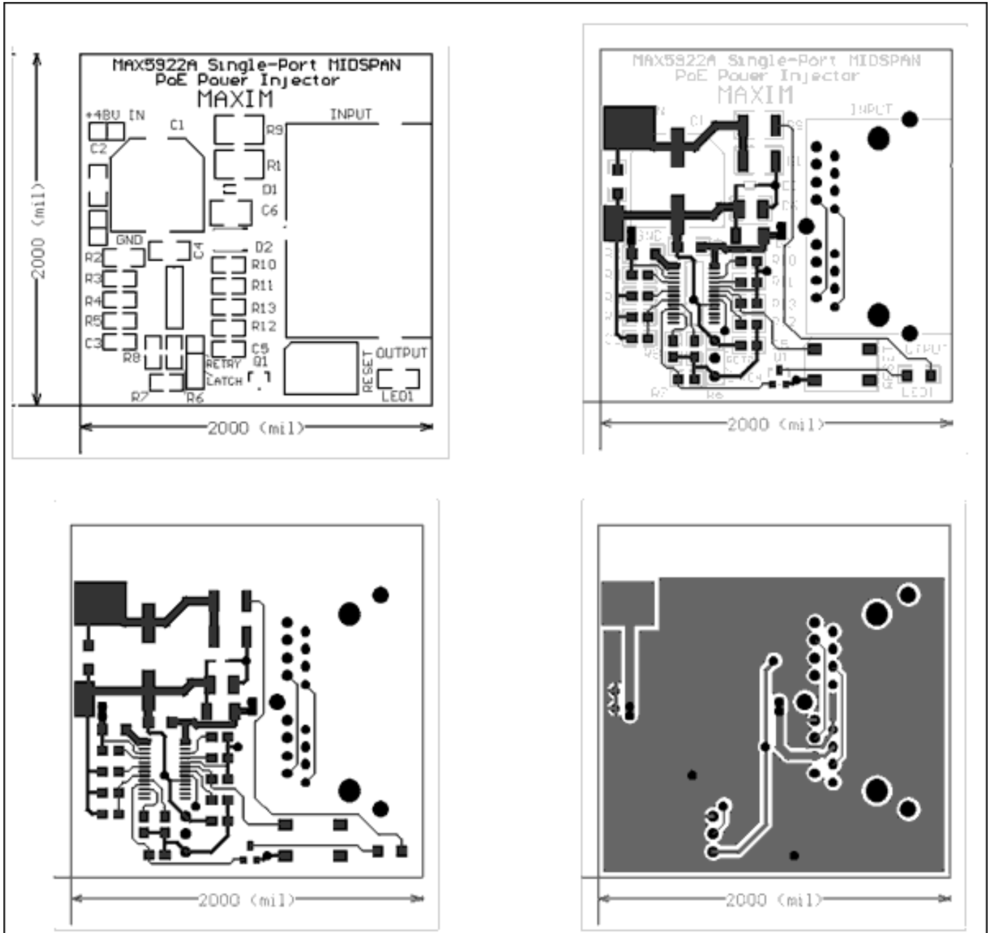
Figure 2. Circuit PCB layout information.

C4 and D2 are protective devices to absorb ESD and cable discharge energy applied to J1. They are also used to clamp any inductive kickback current when the MAX5922 turns off the output after an output short-circuit event. Figure 2 shows the PCB layout for the MAX5922 and Table 1 is the bill of materials.