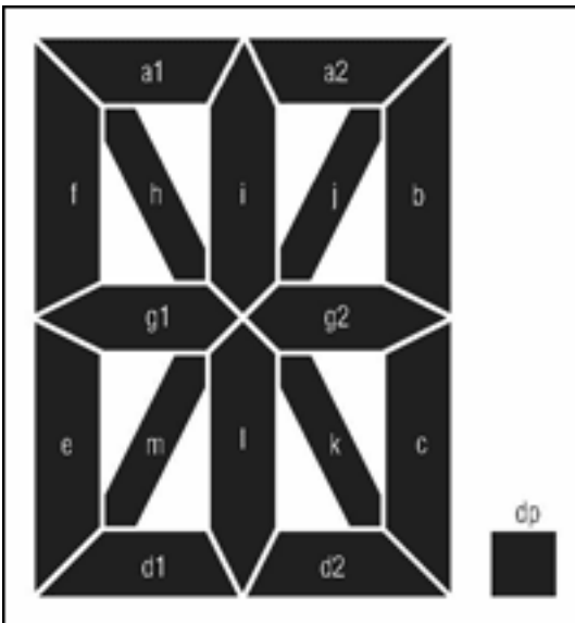
Figure 2. Segment labeling for 16-segment displays.